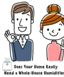
Does Your Home Really Need a Whole-House Humidifier?

The filter helps protect the cooling coil and other parts of the system. When the coil gets dirty, air flow is restricted causing mold and high temperature safety limits to fault when in heating mode. A dirty filter also causes the furnace to run longer than needed which increases utility bills. Your filter protects your blower motor, helping to increase its life span. It is essential to replace your filter each month for a longer lasting and more energy efficient system.